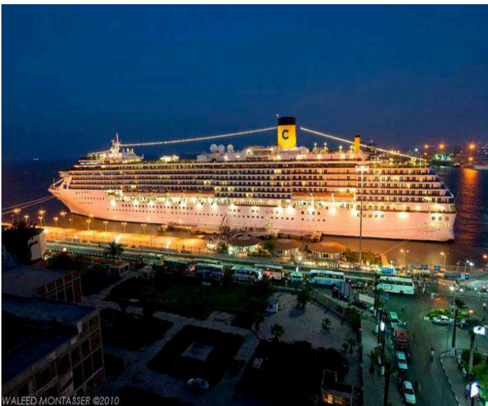
WALEED MONTASSER ©2010